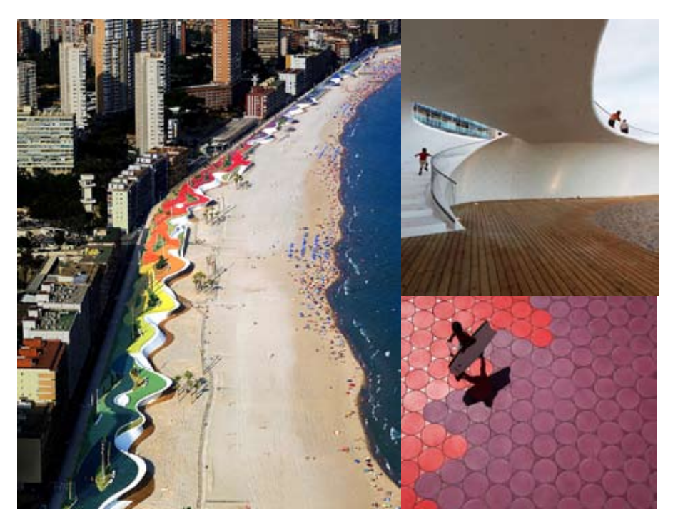
Paseo Marítimo de la Playa Poniente Benidorm (Spain), 2009

The insertion of a pavilion-cum-theatre programmatically revitalises the Laurenskerk cathedral square and articulates its relationship with the Delftsevaart canal.