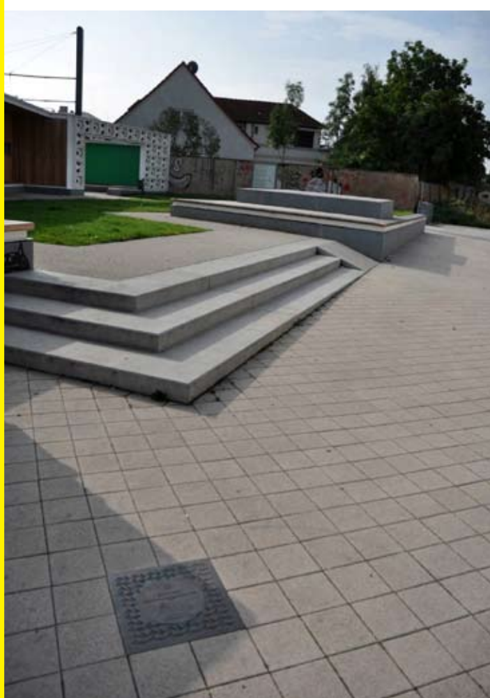
The Prize-winner's plaque now in place in front of the Open-Air-Library in Magdeburg.