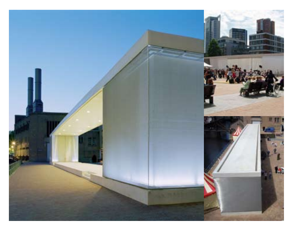
Urban Activators: theater podium & brug Grotekerkplein Rotterdam (The Netherlands), 2009

AUTHORS: Atelier Kempe Thill architecs and planners DEVELOPERS: Rotary Club Rotterdam Noord, foundation 'Grotekerkplein', OBR Rotterdam