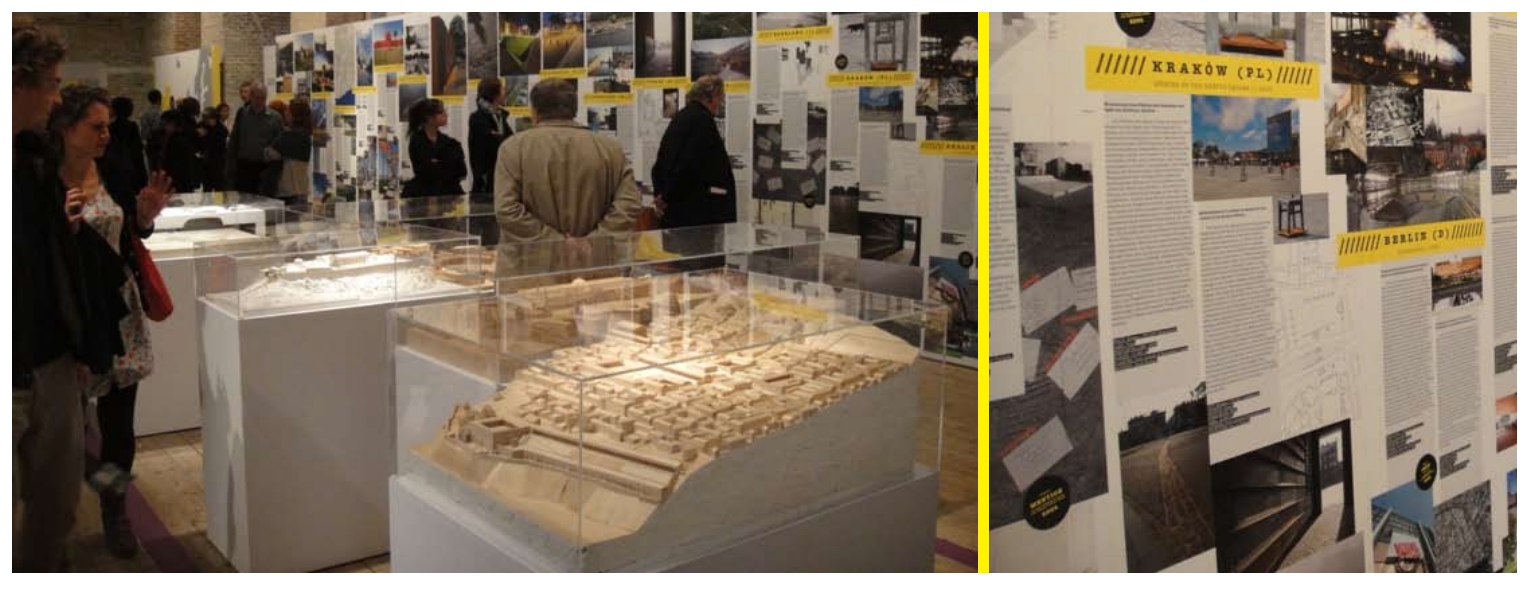
"Platz da! European Urban Public Space" at the Architekturzentrum Wien (Vienna) from 14 October 2010 to 31 January 2011