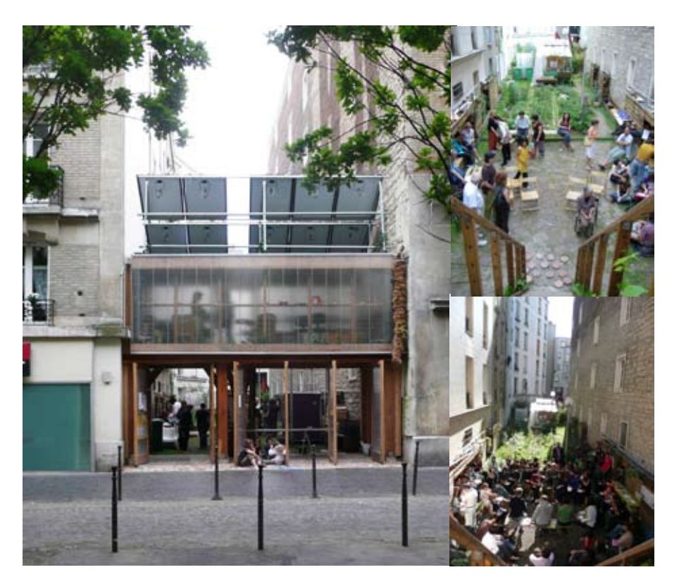
Passage 56 / espace culturel écologique Paris (France), 2009

AUTHORS: atelier d'architecture autogérée DEVELOPERS: atelier d'architecture autogérée