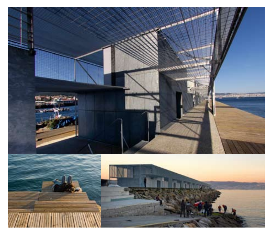
Casetas de pescadores en el puerto

Popular initiative has transformed an abandoned passageway of rue Saint Blaise into a collectively-managed ecological garden.